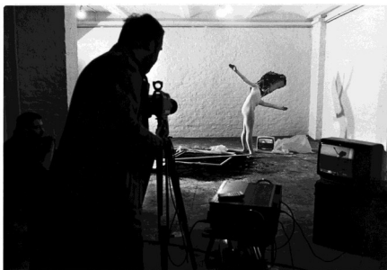
Lutz Dammbeck Herakles , 1984–2008 Photo: Barbara Berthold-Metselaar © VG Bild-Kunst, Bonn 2019 and Lutz Dammbeck