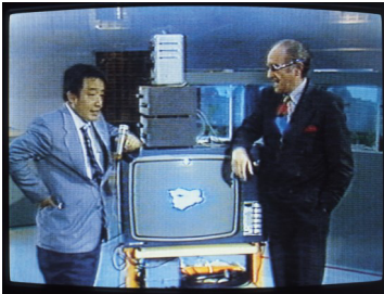
Nam June Paik as guest of Alfred Biolek WDR Köln, 12 April 1984, 13 min.