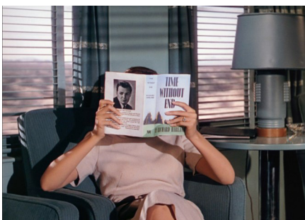
Klaus vom Bruch Time Without End , 1996/2017 Video still HD Video, colour, sound, 6:39 min. Videoart at Midnight Edition Nr. 23 © VG Bild-Kunst, Bonn 2019