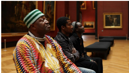
Marcel Odenbach Im Schiffbruch nicht schwimmen können , 2011 Film still © VG Bild-Kunst, Bonn 2019 Courtesy of Galerie Gisela Capitain, Stampa Galerie and Videoart at Midnight Edition